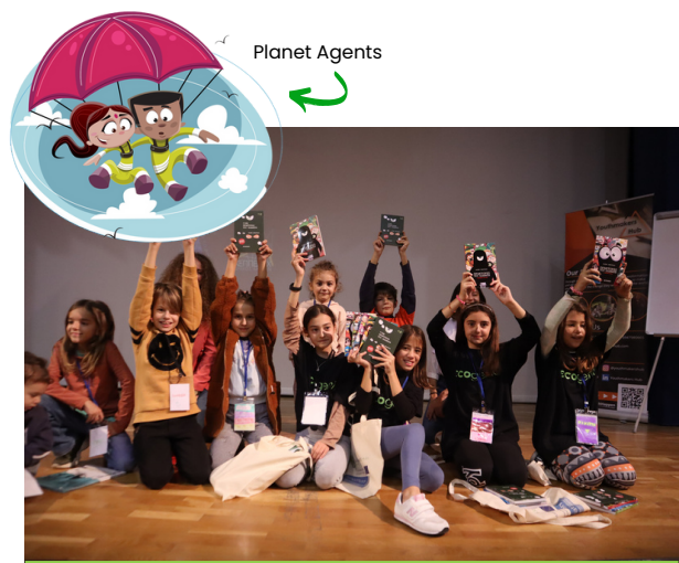
Our Local Green Heroes receiving their Climathon prizes

A very big thank you to our event sponsors and in-kind donors who enabled this first-of-its kind event: Latsis Foundation, V Group, Planet Agents ; and local sponsors who provided prizes and in-kind support: Jacobs, Popi's Bookstore, Samaria, Ntounia Farm.