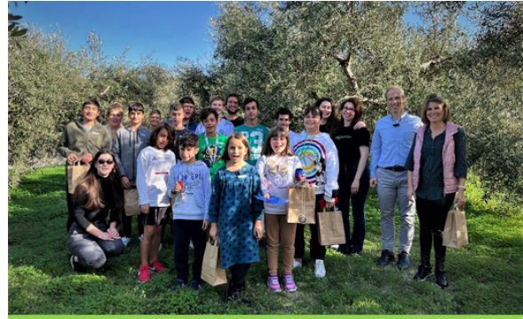
Kids Day with Terra Creta

At least 22 parents consistently participated through special events, volunteer opportunities, etc.