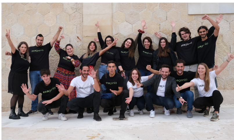
Ecogenia Team & Chania Cohort during the 2022 Chania Climathon