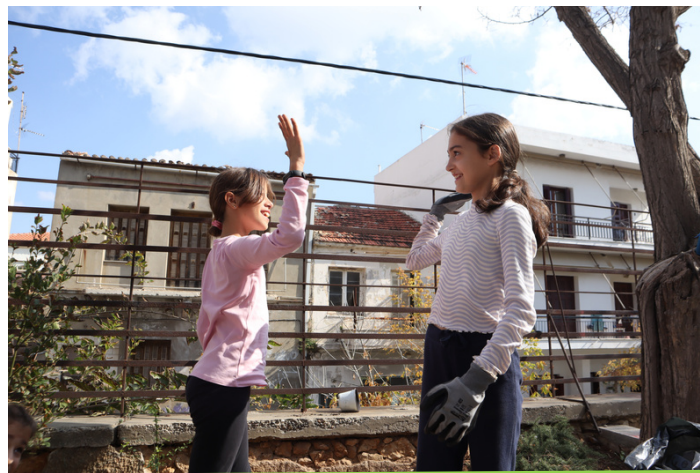
Local Green Heroes in action during Volunteer Day

The program sought to address the gaps that exist in environmental education. Through game-based activities and experiential learning, the kids learned about: volunteering, teamwork, active citizenship, sustainable development as well as the 17 Sustainable Development Goals.