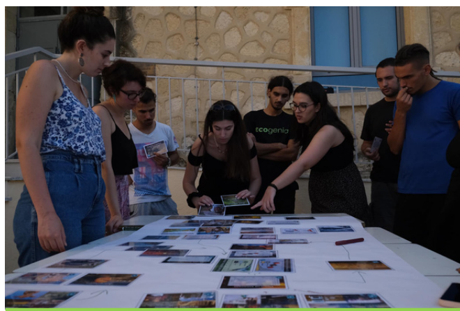
Chania Cohort during nEUCitizenship Training Week

As well as their knowledge of sustainable development and their sense of feeling informed about the ways they can contribute to the betterment of their community(ies).