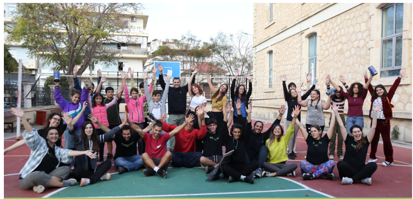
Our Local Green Heroes during the Open Volunteer Day

They also secured local sponsorships for the supply costs for the day.