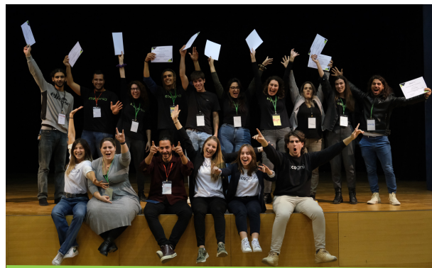
Chania Cohort after the certification ceremony

Most of the Chania 2022 cohort will continue with their studies, and one will go on to do his military service. Ecogenia is currently working on developing an alumni network for all 2022 pilot cohort teams to unite and continue engaging with our collective vision on climate action and civic service.